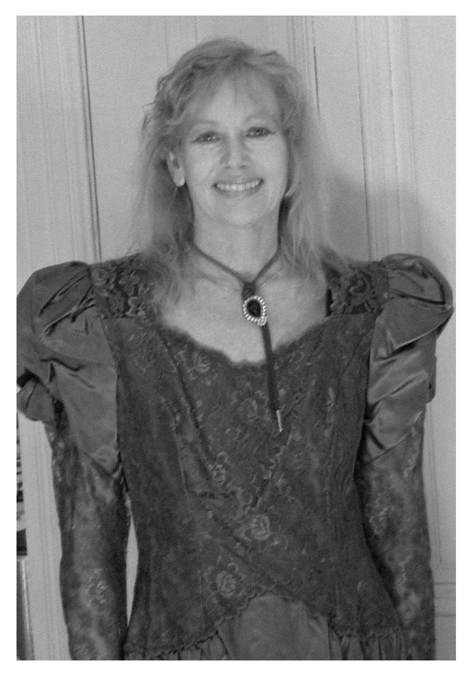
ATTAINING DIVINE CONSCIOUSNESS! A Universe of Sublime Wholeness Beyond Conception Awaits You at the Summit of Being